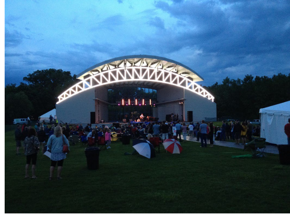
2014 Inaugural Concert